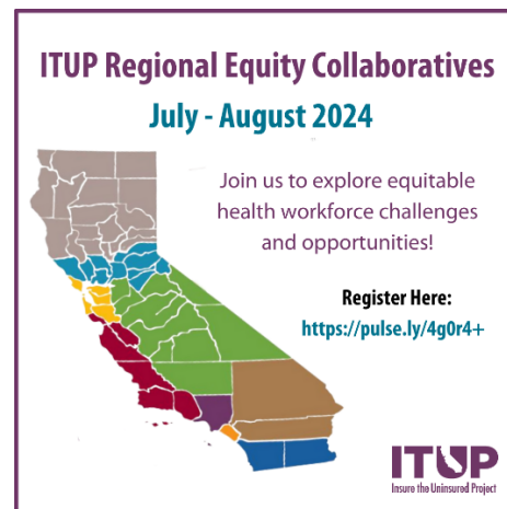
(For use on Facebook, LinkedIn, Website, Email, and Newsletter)